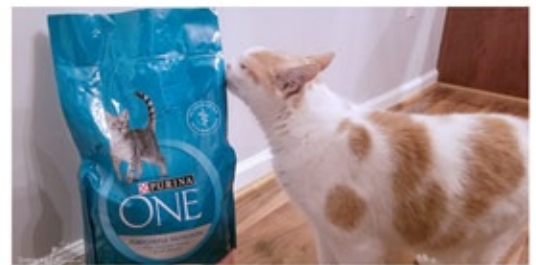
PETS FOR CHILDREN WITH AUTISM & SPECIAL NEEDS